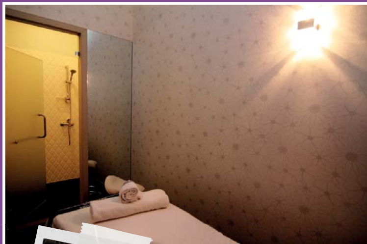
A treatment room with ensuite bathroom.

Of course we do understand, massages and a host of treatments to induce beauty and a well-being is a way of life, not just a gift certificate. But we have to start somewhere. And we do have to re-charge don't we?